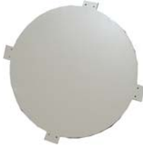
ECP16000 Side Discharge Output